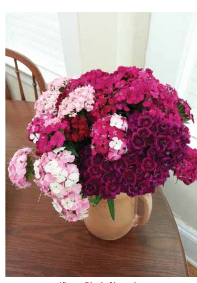
'Sweet Black Cherry'

Comments: .Friends started these for me in their greenhouse, seeded 2/2, transplanted to my garden 4/15, first cuts 6/7; Would be a good crop for tunnels; I liked the color but it was a hard sell to retail florist and event people; Rainy spring and summer led to rotting in the field: 5/14 transplant - bloomed 6/15, 6/13 transplant - bloomed 7/20, still blooming (10/2) in low tunnel - no frost yet; Liked this one a lot; People visiting our trials loved how dark the colour was: we call it "old Hollywood glamour red": Stems were a little short, probably our hot weather, planted 5/20 with 6-inch spacing; I sowed half early and the rest later, I found that when the first sowing is blooming, there are so many other