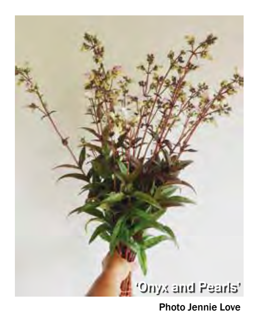
Penstemon 'Onyx and Pearls'

Good Qualities: Flowers have a great wildflower look, attract pollinators and beneficials, and the foliage is beautiful year round, seed heads can also be harvested and sold; Interesting light/dark contrast of petals and sepals and stems, nice for "moody" spring design work, nice textural plant, seems to be very drought tolerant and vigorous; I feel like this beauty is just getting started! It's a robust and elegant plant that smothers out any weeds in the bed so that's a delight, the flowers are a lovely and delicate/sophisticated touch in designs, especially for wedding work, stems are rigid and straight, the seed heads are super cool too if you can manage to not cut all the flowers.