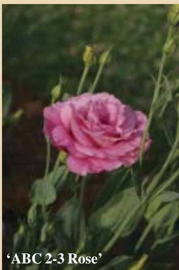
'ABC 2-3 Rose'

They combined their double-flowered types - Avila, Balboa, and Catalina - into one series known as ABC, and their single-flowered types - Laguna, Malibu - into the Laguna series. The names are followed with a number referring to the optimum season or day/night production temperature: 62-66/55-60°F for the 1-2 group, 66-70/64°F for the 2-3 group, and 68-71/65°F for the 3-4 group. Obviously,