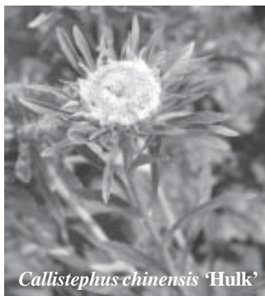
Callistephus chinensis 'Hulk'

Problems: Unattractive flowers (3); Poor germination (2); Hard to know when to cut (2); The thing we disliked the most about Hulk (and we were excited to try it) was that as the yellow disk flowers bloomed, they turned a dirty brown, so unless they were picked before any disk flowers bloomed out, we didn't really like them; For our field conditions, the green bracts that looked so big in the pictures were not very dramatic for us - I recently saw some in commercial bouquets at a store and this bract was very large, so I suspect for us to have better results we would need to grow in a hoopouse or greenhouse. We also didn't really like all the side stems, it slows down bunching to take them off and sort, consumers really didn't say anything about them, they didn't stand out; Have to cut young else the white turns a dirty-drab color too soon; Fusarium