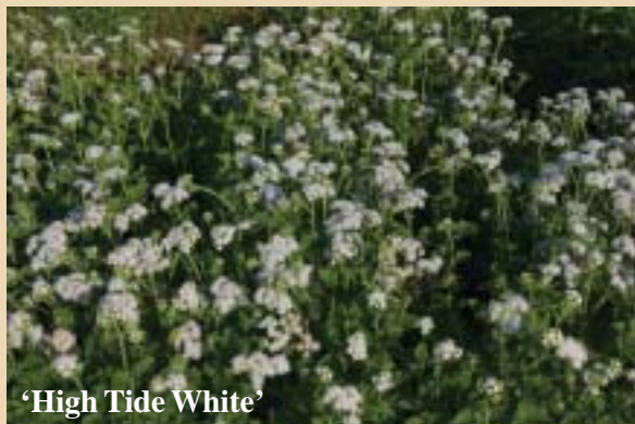
'High Tide White'

Ageratum is a cut flower with a mixed reputation. A filler flower with a great color but not always worth the time it takes to pick the stems after the heads and stems get small - which they inevitably seem to do. Thus, it was with great anticipation that we looked forward to seeing how 'High Tide Blue' and 'High Tide White' (PanAmerican) were going to do in the trials. As the film critics say - one thumb up and one