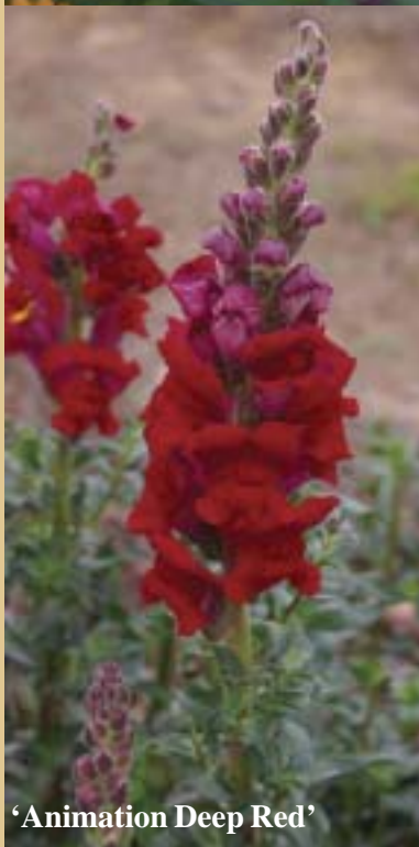
'Animation Deep Red'