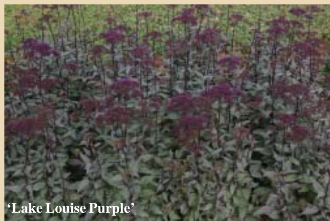
'Lake Louise Purple'

I have a confession to make. I love dark purple tracheliums. At first it may seem like a misguided love - the flower heads are rather unassuming, almost unattractive. However, when they fully open with their large clusters of tiny deep purple flowers and richly colored stems, they make great filler flowers. We have one problem - we cannot grow them in the field. In the greenhouse we get wonderful long-stemmed, large-headed cuts, but in the field we get short stems and small flowers. Year after year we try them and they just don't perform well. If you read the comments section below, you will see that other trialers have also been frustrated by this plant. In our defense we are getting better at them and this year we actually had many harvestable stems. The problem with