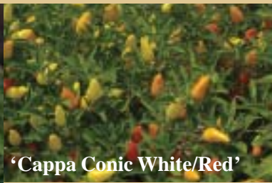
'Cappa Conic White/Red'