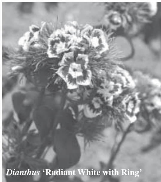
Dianthus 'Radiant White with Ring'

Good Qualities: Beautiful, rich color (6); Shape, length and foliage, made it through 55 inches of rain and hail; Full blooms; Upright facing face - not so 'eastward' facing, nice in bouquets - good size; A very nice pollenless single-cut sunflower for