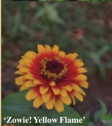
'Zowie! Yellow Flame'