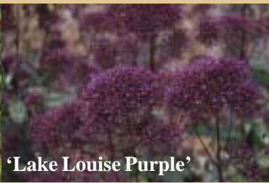
'Lake Louise Purple'