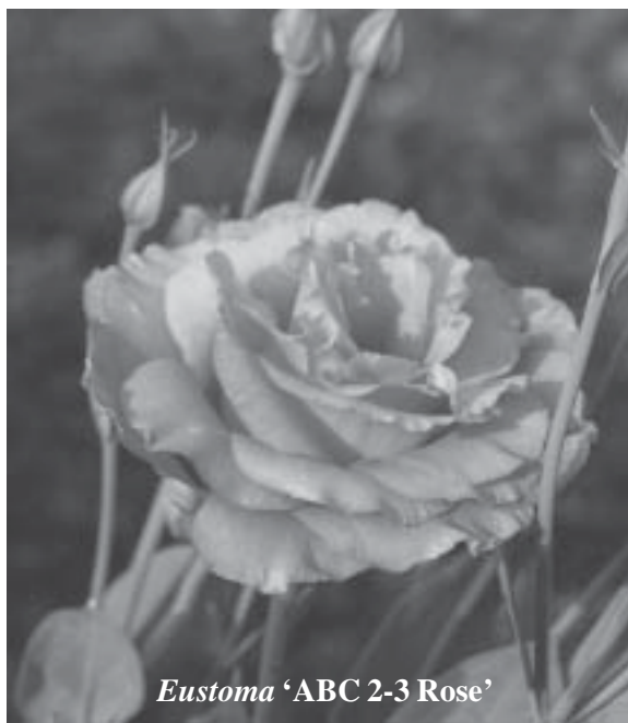
Eustoma 'ABC 2-3 Rose'

Additional comments: Could not see any major difference from the ones I already grew; This was not my best year with lisianthus generally, none of these cultivars really did anything outstanding for me; General comments on trial (Zone 5, applied to all varieties tested): There were two trials, one in a high tunnel, the other outdoors, both had 2 reps, on shallow beds, 4 rows with 9 x 9 inch spacing, green plastic mulch and trickle irrigation, transplant dates the same for both trials, plants continued producing all summer, with no lag due to the heat.