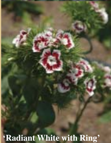
'Radiant White with Ring'